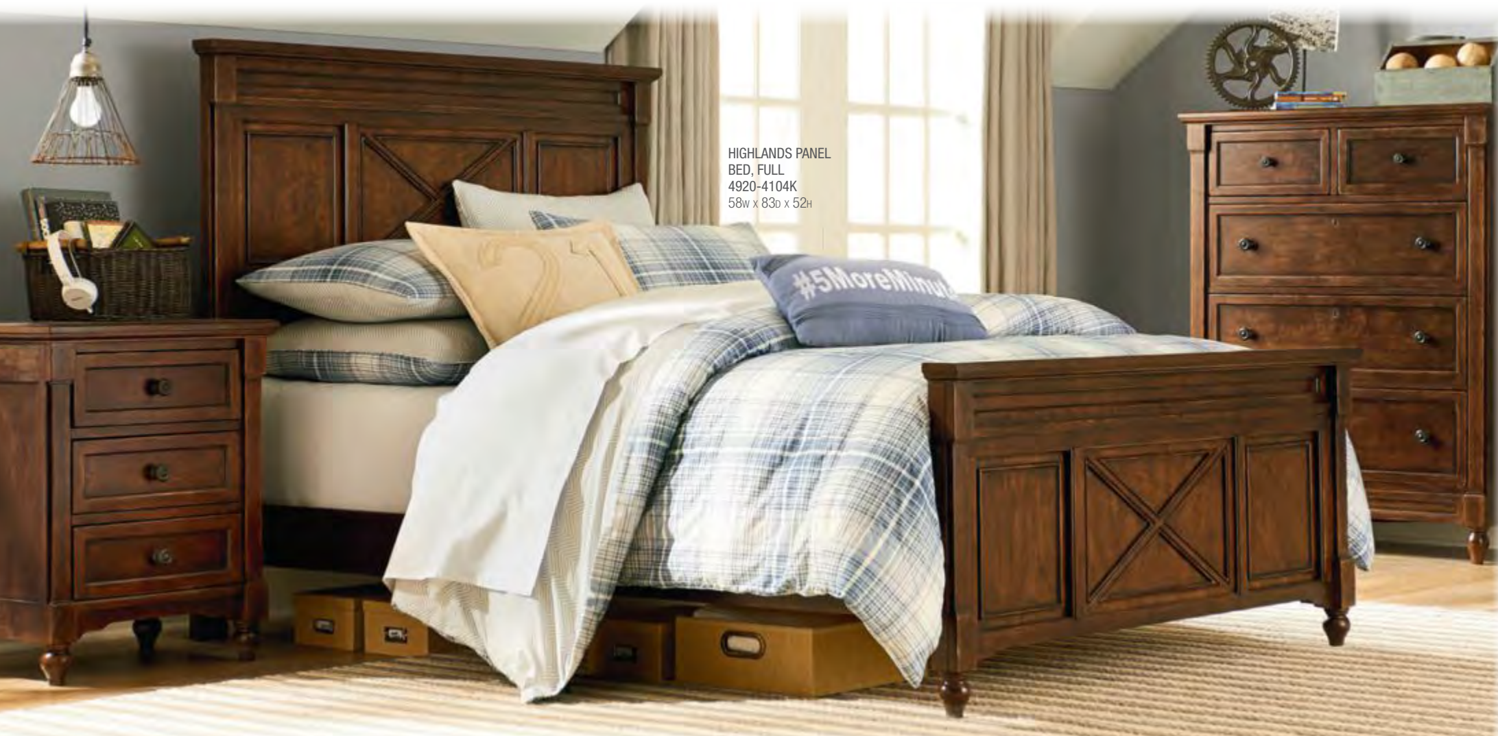
HIGHLANDS PANEL BED, FULL 4920-4104K 58w x 83d x 52h