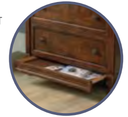
DRAWER CHEST 4920-2200 38w x 18d x 50h