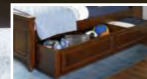
Trundle/Storage Drawer shown with removable dividers for storage.