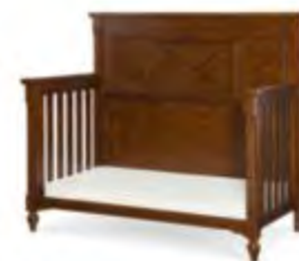
Preschool Daybed Ages 3-4