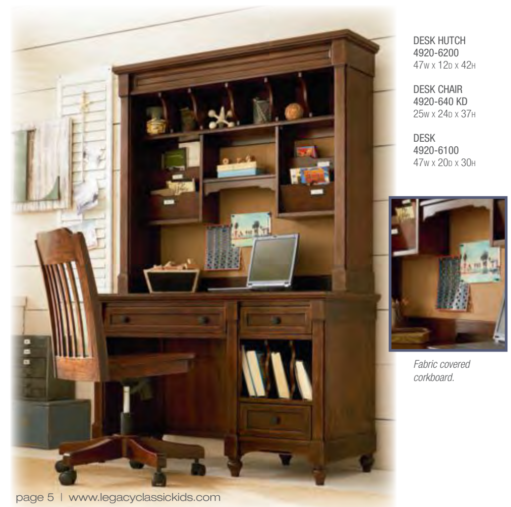
DESK HUTCH 4920-6200 47w x 12d x 42h