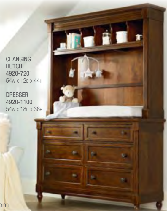
CHANGING HUTCH 4920-7201 54w x 12d x 44h