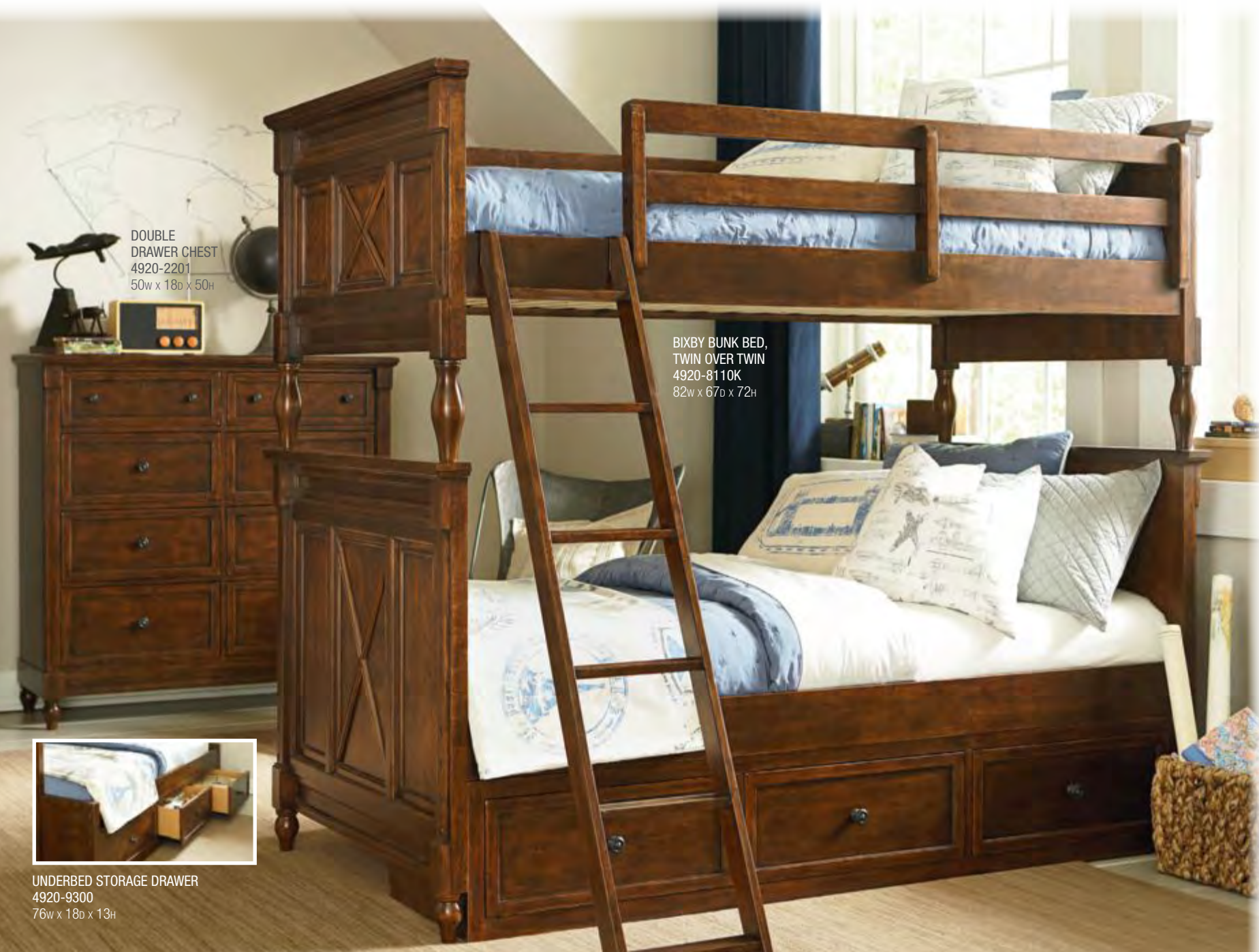
DOUBLE DRAWER CHEST 4920-2201 50w x 18d x 50h