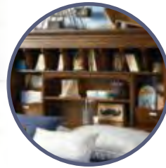
Headboard features storage areas with removable dividers.