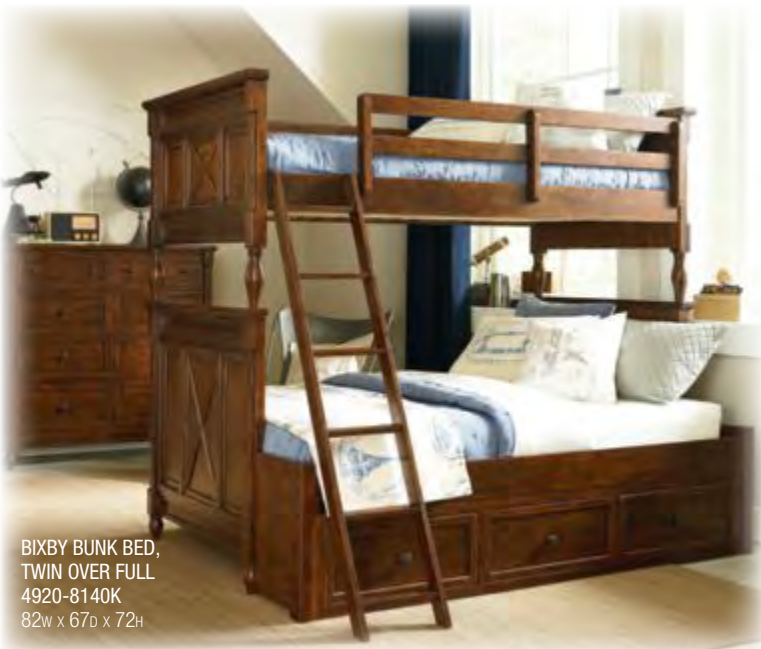
BIXBY BUNK BED, TWIN OVER FULL 4920-8140K 82w x 67d x 72h