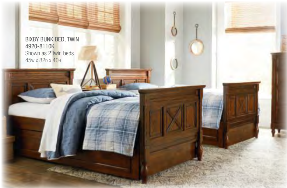
BIXBY BUNK BED, TWIN 4920-8110K Shown as 2 twin beds 45w x 82d x 40h