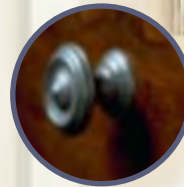
HIGHLANDS PANEL BED, TWIN 4920-4103K 43w x 83d x 52h