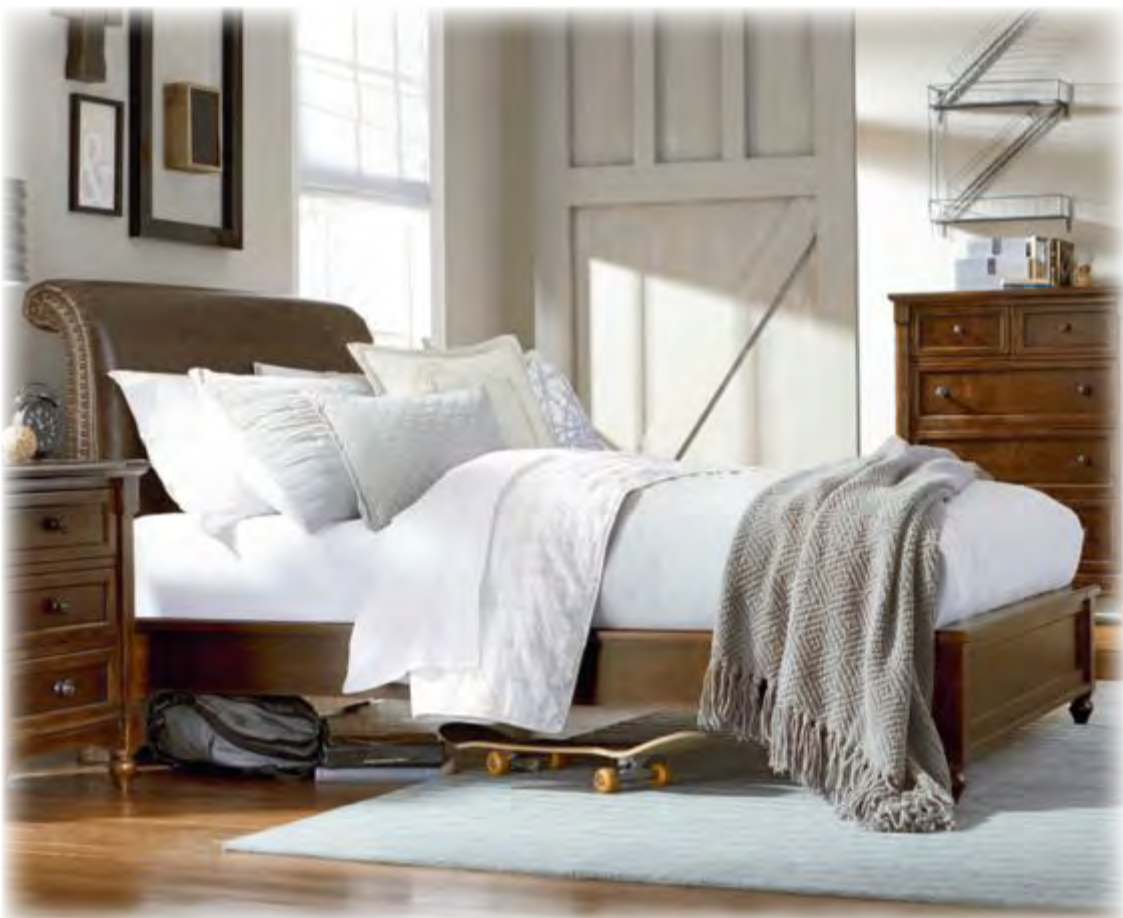
MONTEREY PLATFORM BED, FULL 4920-4844K 58w x 86d x 45h