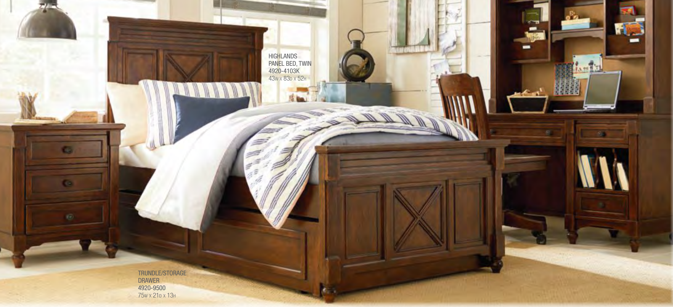
HIGHLANDS PANEL BED, TWIN 4920-4103K 43w x 83d x 52h