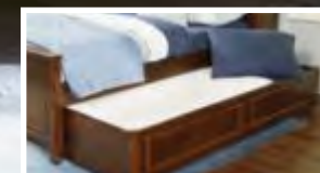
Trundle/Storage Drawer shown with mattress for sleep.