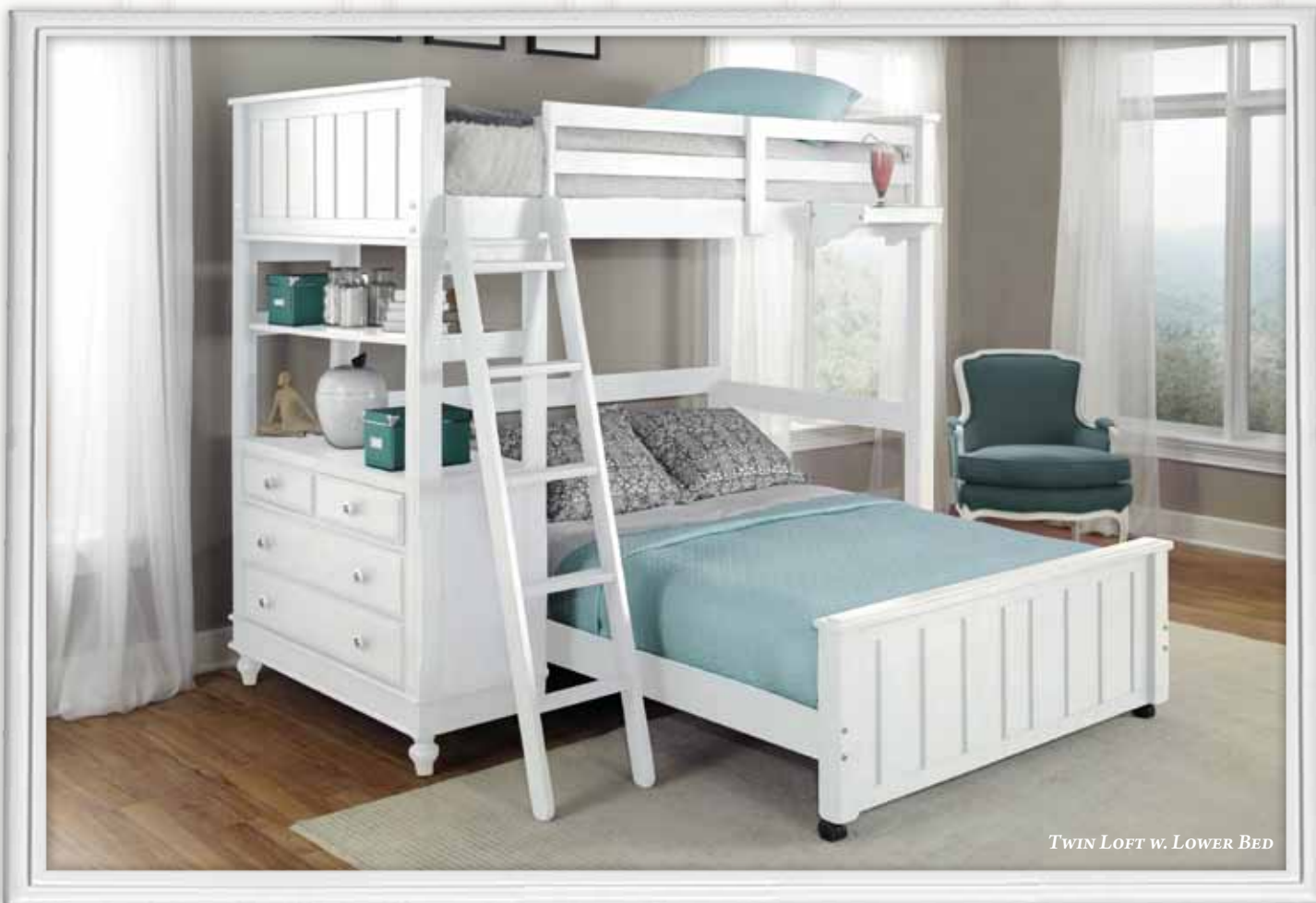
TWIN LOFT W. LOWER BED

Hanging Nightstand X590 15"L x 10"W x 5.5"H