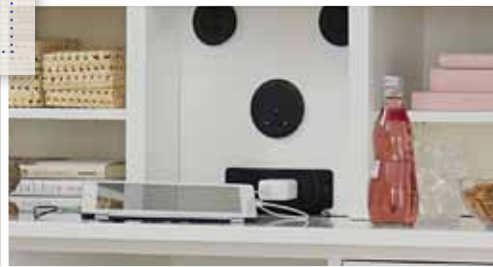
CHARGING STATION, AMP & SPEAKERS