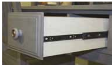
FULL EXTENSION, BALL BEARING GUIDES