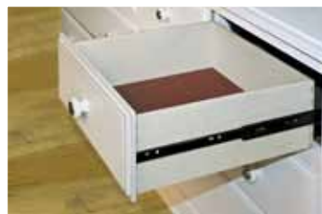
FELT LINED TOP DRAWERS