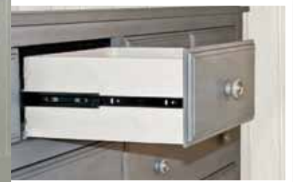
FULL EXTENSION, BALL BEARING GUIDES