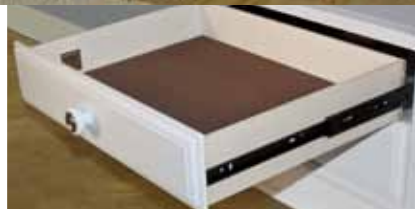
FELT LINED TOP DRAWER