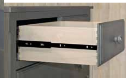
FULL EXTENSION, BALL BEARING GUIDES