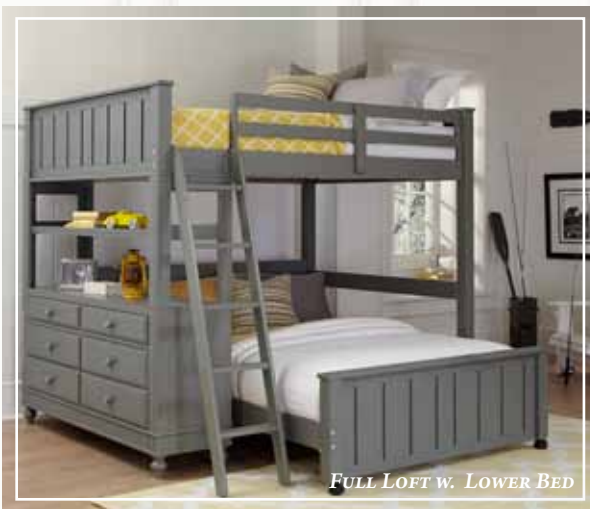
FULL LOFT W. LOWER BED