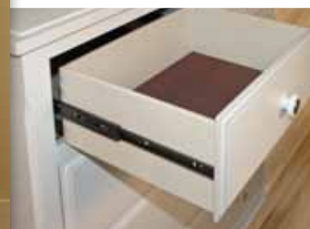
FELT LINED TOP DRAWERS