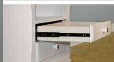
FULL EXTENSION, BALL BEARING GUIDES