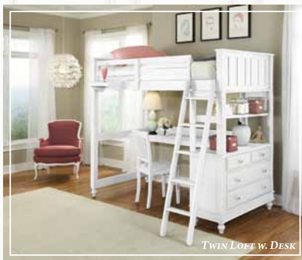
TWIN LOFT W. DESK