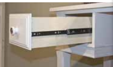
FULL EXTENSION, BALL BEARING GUIDES